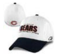
2003 training camp hat