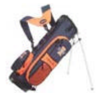
Team logo golf items! Illinois Notre Dame | Sox Bears | Other teams