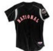
All-Star jerseys & t-shirts