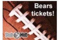
See the "new" Soldier Field